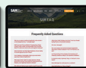
Smart Approaches to Marijuana