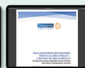
The Failed Portugal Model