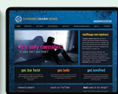
Cannabis Skunk Sense