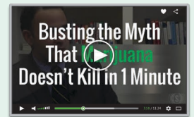
Busting the Myth That Cannabis Doesn't Kill