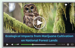
Marijuana's Ecological Impact