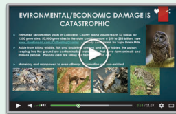
Environmental Damage of Marijuana – US West