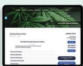
Cannabis Resource Library