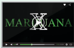
Marijuana X - Directors Cut