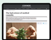
The Bad Science of Medical Cannabis